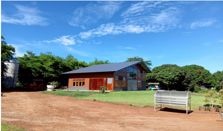
Main accommodation building at Uncle Phannob

The following photographs were taken during the pre-visit to Uncle Phannob Camping and Trekking. They document key areas referenced in the risk assessment above and should be used to brief staff and students before the trip.